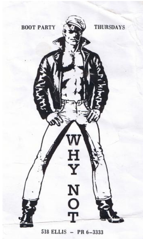
Ad for The Why Not's boot party in a 1971 issue of the B.A.R.